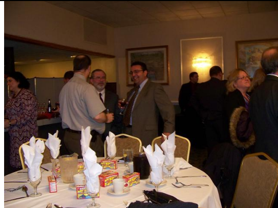
Over 70 professional attended our presentation